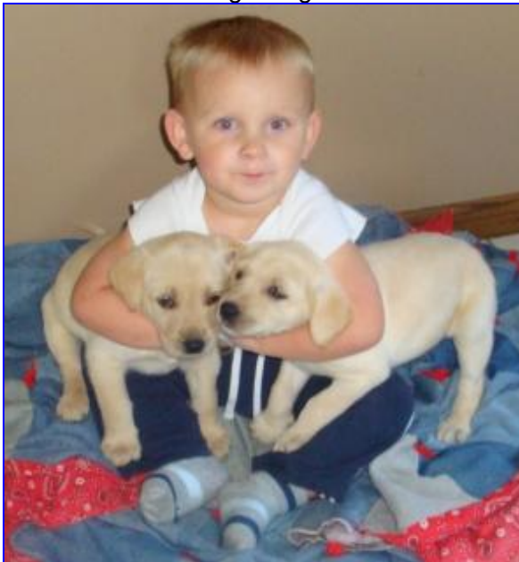
Some of these children are very young—six, seven, and ten years old. This is actually a

You are probably wondering why I would discuss this issue in a newsletter which is primarily directed at children's health. The sad reality is that we, as chiropractors, all see a large number of children with the beginnings of arthritis.